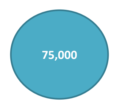
Businesses in our Network