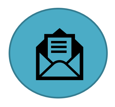
Media Reach of over 20,000